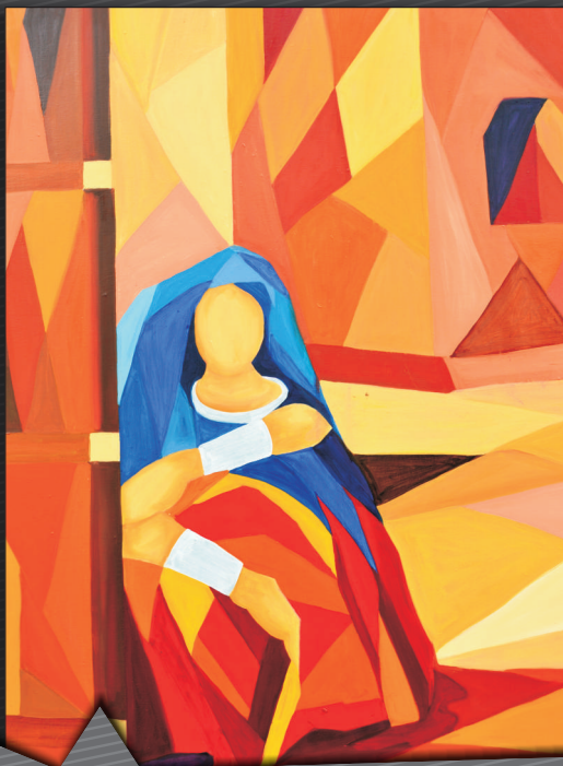
Awaiting Oil on Canvas 36x48