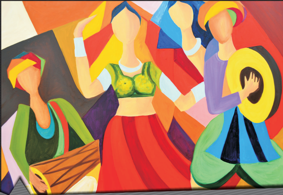
Celebration of Life Oil on Canvas 36x48