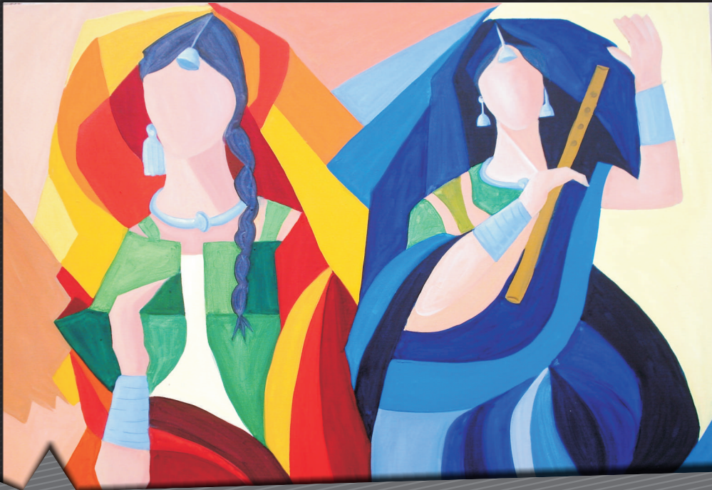
Dance to My Tunes Oil on Canvas 36x48