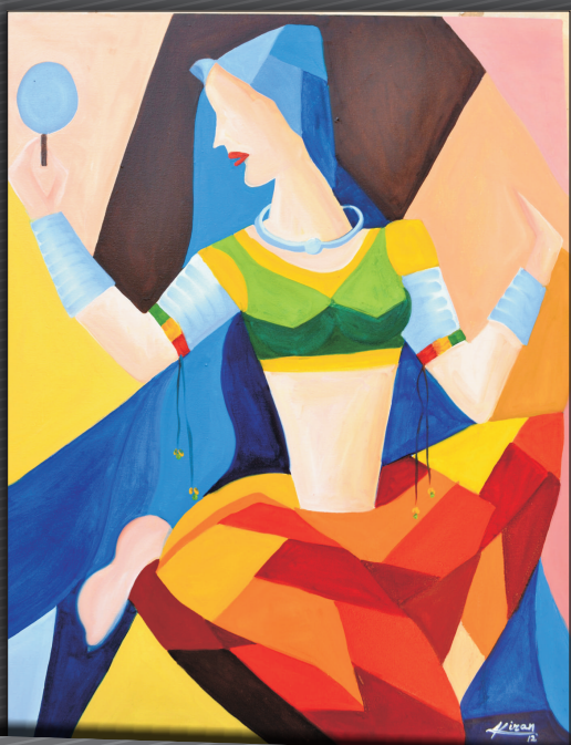
Vanity Oil on Canvas 30x36