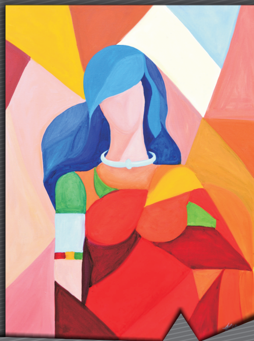
Enigma Oil on Canvas 30x36