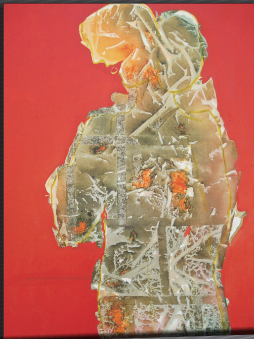
Dainty Lady Oil on Canvas 36x48