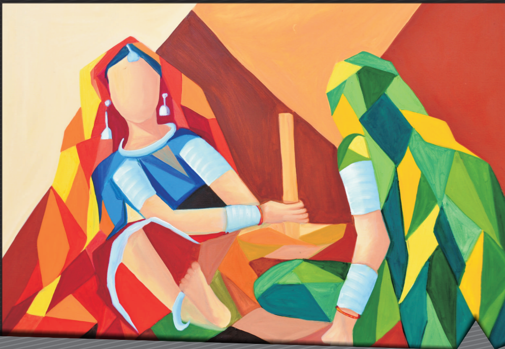
Grinding Pace of Life Oil on Canvas 36x48