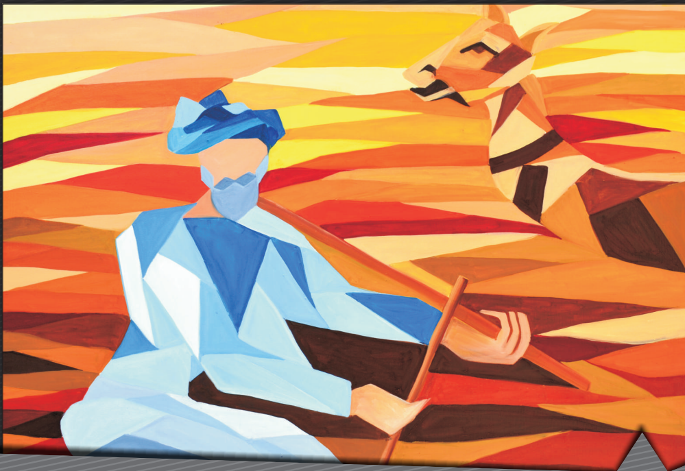
Desert Symphony Oil on Canvas 36x48