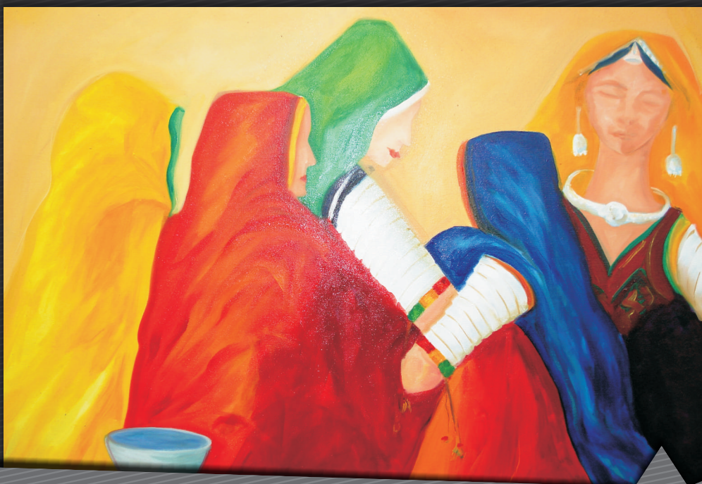
Womenpower Oil on Canvas 36x30