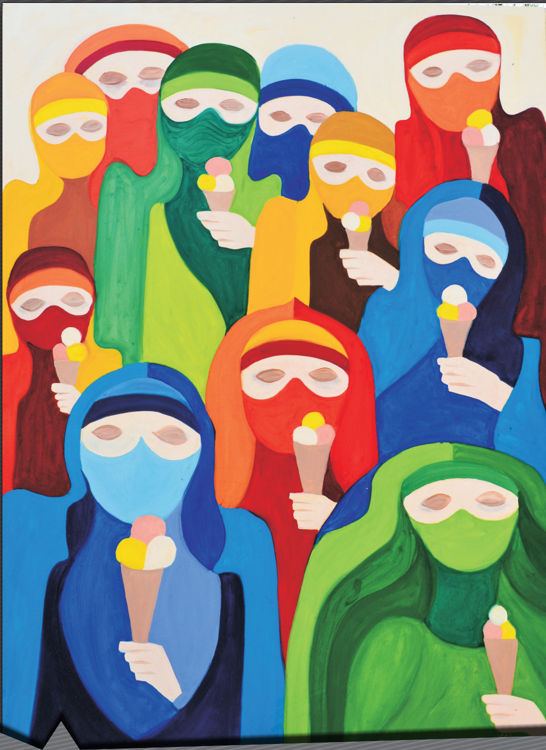
Empowering Women Oil on Canvas 36x48