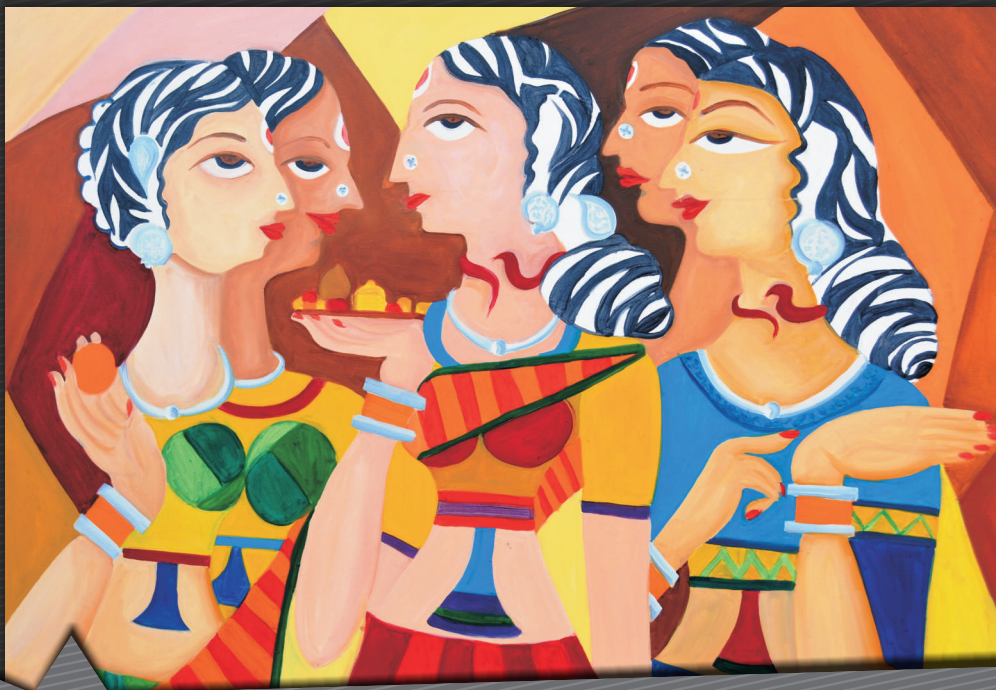
Poojitime Oil on Canvas 36x48