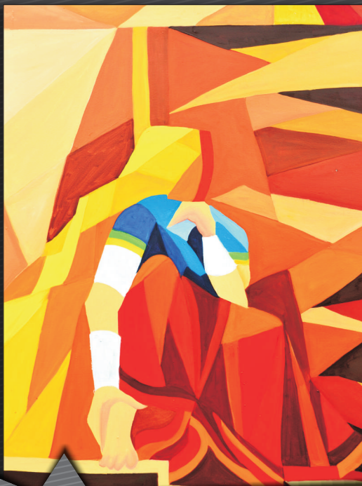
Looking Beyond I Oil on Canvas 36x48