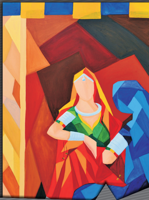
Looking Beyond I Oil on Canvas 36x48