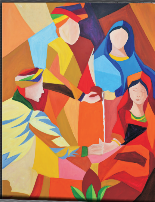
Kanyadaan Oil on Canvas 36x48