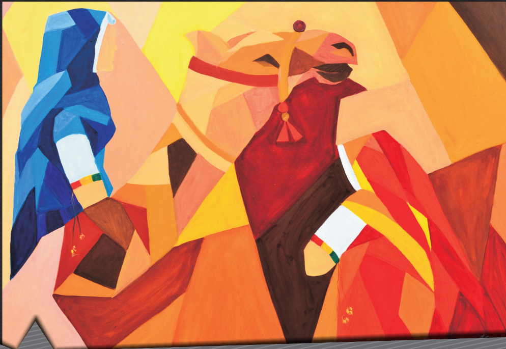
Desert Walk Oil on Canvas 36x48