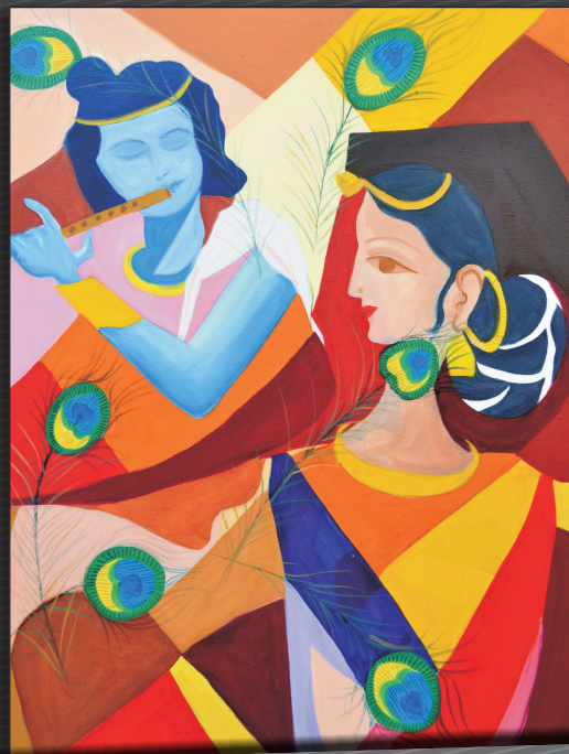
Radha Krishna Oil on Canvas 30x36